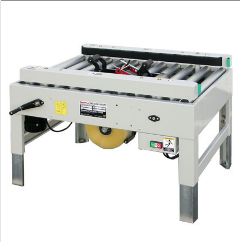
MS20 Manual Side Drive